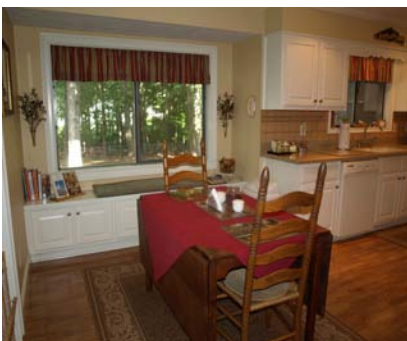
The kitchen eating area

If you have children, they will love this play house