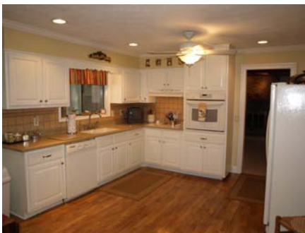
The wonderful eat-in kitchen

Imagine owning your own lake front house, plus pool