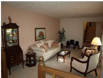
The air of gracious formality