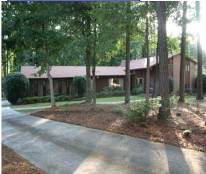
A house that says, "come in"

Happiness Is...1.25 acre a Lake Front Property with a Beautiful in ground pool..